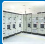
Power Protection Panel

Integrated Power Protection, Automation & Controls, Power Quality PRODUCTS & SOLUTIONS