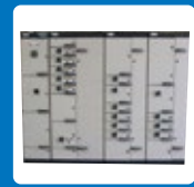
Intelligent Motor Control Centre