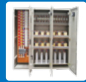
Power Factor Improvement Capacitor Bank