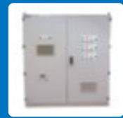
Automation & Control Panels