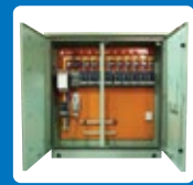
Sub Main Distribution Panel